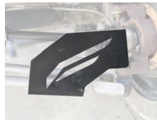
CV Guards PN: 18975-R