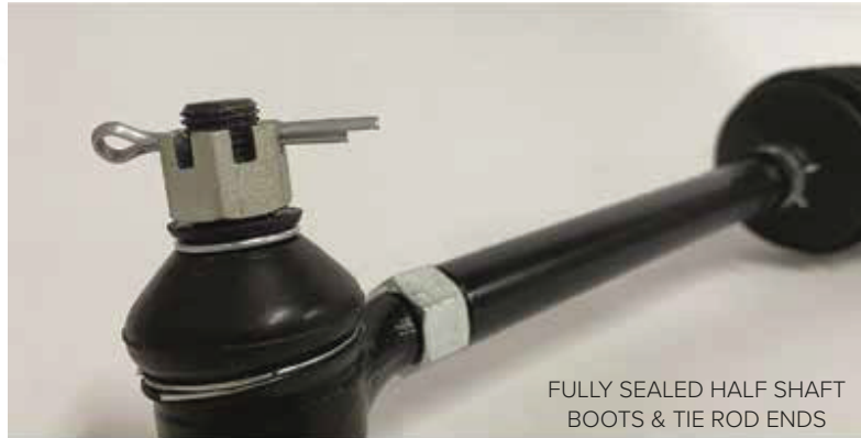
FULLY SEALED HALF SHAFT BOOTS & TIE ROD ENDS

No need to worry about dirt, debris or sticks stopping your ride experience.