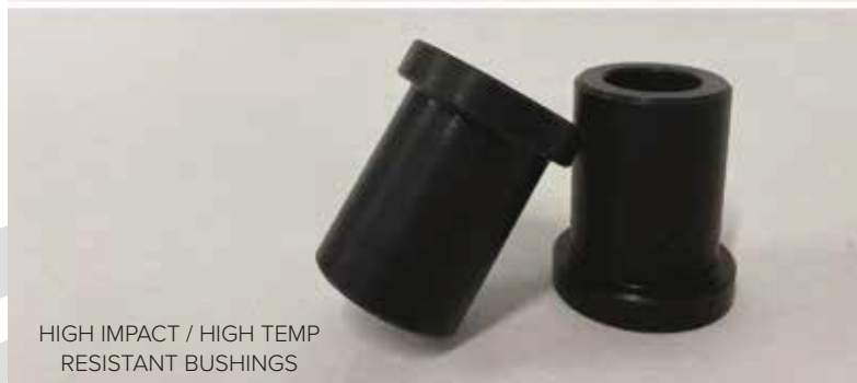
HIGH IMPACT / HIGH TEMP RESISTANT BUSHINGS