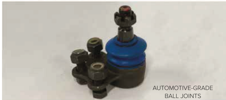
AUTOMOTIVE-GRADE BALL JOINTS