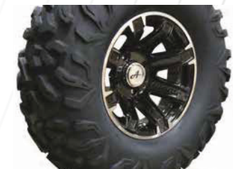
Wheels/ Rims (Blk Aluminum, Red Aluminum, All-Terrain DOT Tires, Commercial DOT Tires) PN: 17288-R (Shown)

Browse All Accessory Options Online: AmericanLandmaster.com/2021-Accessories