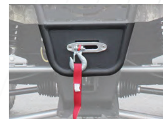
2,500 Lbs. Nylon Rope Winch PN: 18931-R