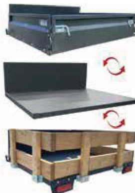
CONVERTIBLE STEEL BED / FLAT BED

Not available for the L7 & L7x or any models over 24mph.