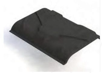
Plastic Roof PN: 19063-R