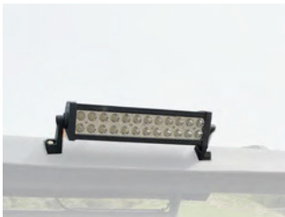
Front LED PN: 18921-R